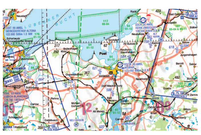
Excerpt from ICAO Chart, Rostock page with ABAs.