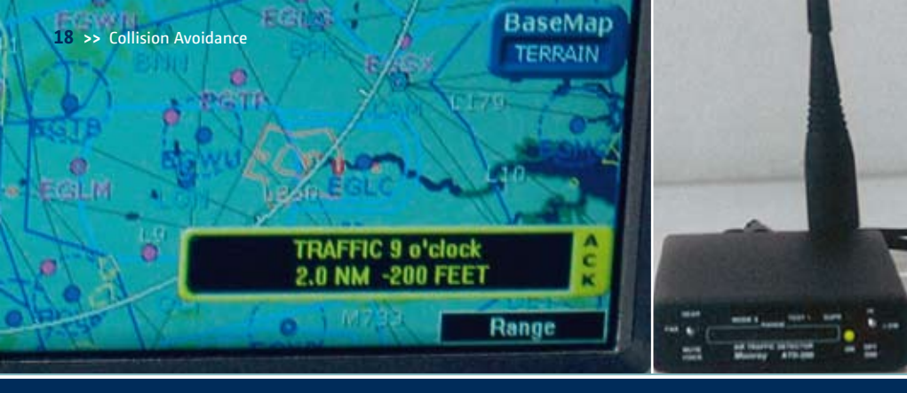
↑ 3 EXAMPLES OF ONBOARD EQUIPMENTS INCREASING PILOT SITUATION AWARENESS

COLOUR ; Aircraft finished in one high contrast colour can be seen more easily than those with a pattern or one low contrast colour.